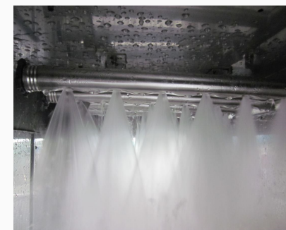
Nozzle design with wide angle water jet type