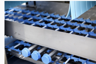
Special process wash arm set